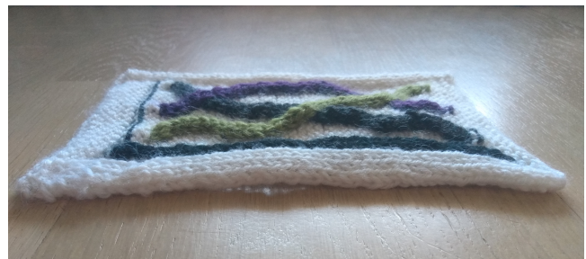
(b) side view

Figure 3: A line chart knit through the use of the cable knitting technique. The multi-color cable knitting technique involving intarsia allows for different colors of yarn to be used for each of the lines. In addition, the cables provide an embossed effect that can be observed from multiple viewing angles, even from a side view, and felt.