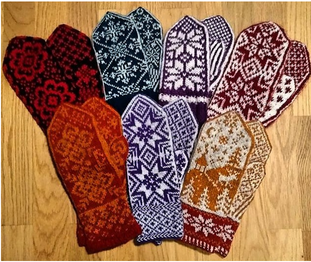
Figure 1: A collection of Norwegian-style Selbu mittens I have knitted in Norwegian wool (patterns all by Skeindeer Knits). Varying yarn thickness and needle size allows for patterns at different resolution to be created. The bottom right pair is knitted with thinner yarn and needles than the top right pair.

In cable knitting, the order of the stitches on the needle is changed by passing groups of stitches over or behind other groups of stitches. Often this is combined with making the cables stand out by using knit stitches on the right side while using purl stitches for the background.