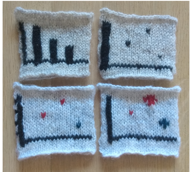
Figure 2: The four charts used by Tamara Munzner to explain the definition of marks and channels recreated in knit form. The samples also reveal how the chart axis can vary in thickness and include or exclude tick marks.