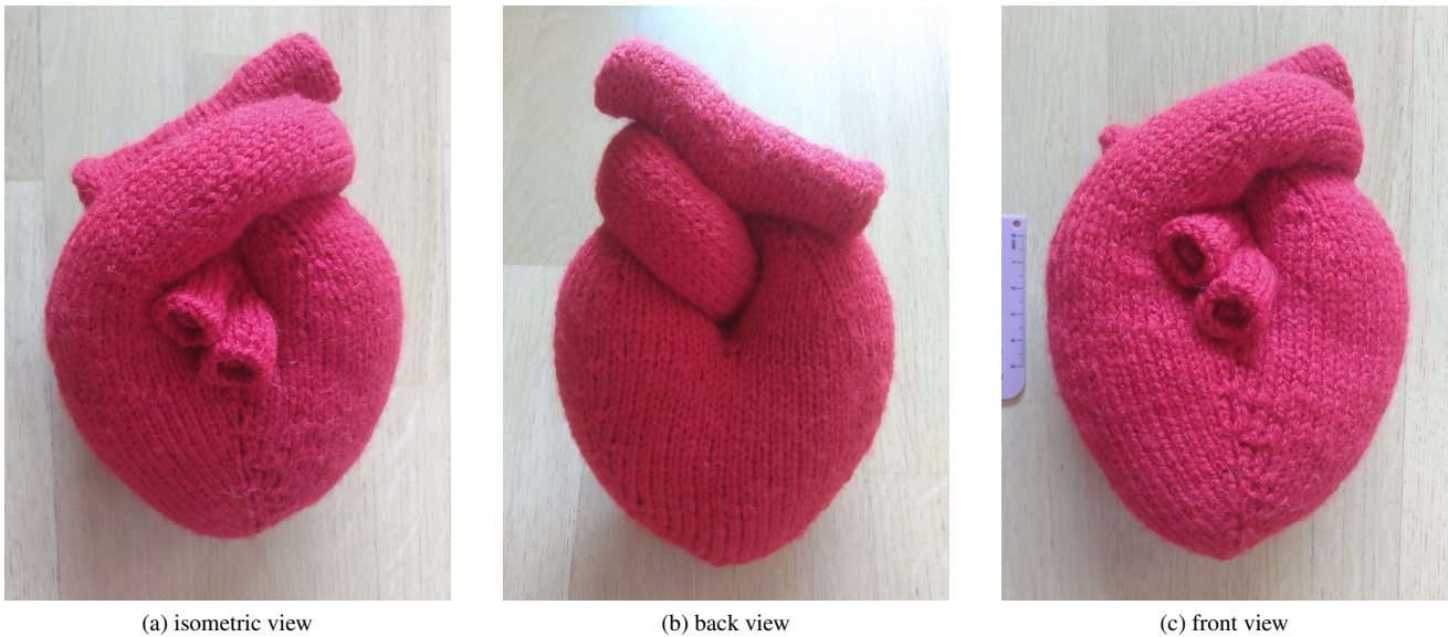
Figure 4: A simplified anatomical heart model knit in a red wool-nylon blend. The different vessels are not sewn on, but knit in the round in one piece with minimal sewing. Through the use of stuffing material, the knit material becomes 3D and rather squishy.

combination of the soft stuffing with the fuzzy knitted material gives an almost cartoon-like impression, in stark contrast to how disembodied human hearts typically appear in the real world. In a way, this makes a medical concept where a realistic representation can elicit a strong negative response more approachable. Perhaps it is similar to how surgical images can be made more palatable by using color manipulation and stylization [2].